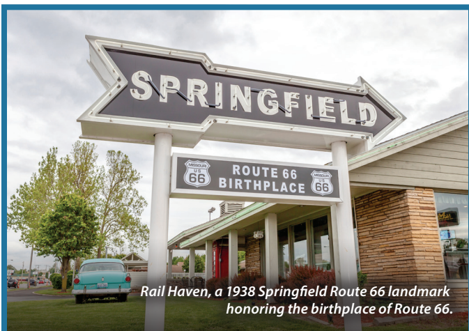
Rail Haven, a 1938 Springfield Route 66 landmark honoring the birthplace of Route 66.

The Partnership supports the expansion of broadband throughout the state.