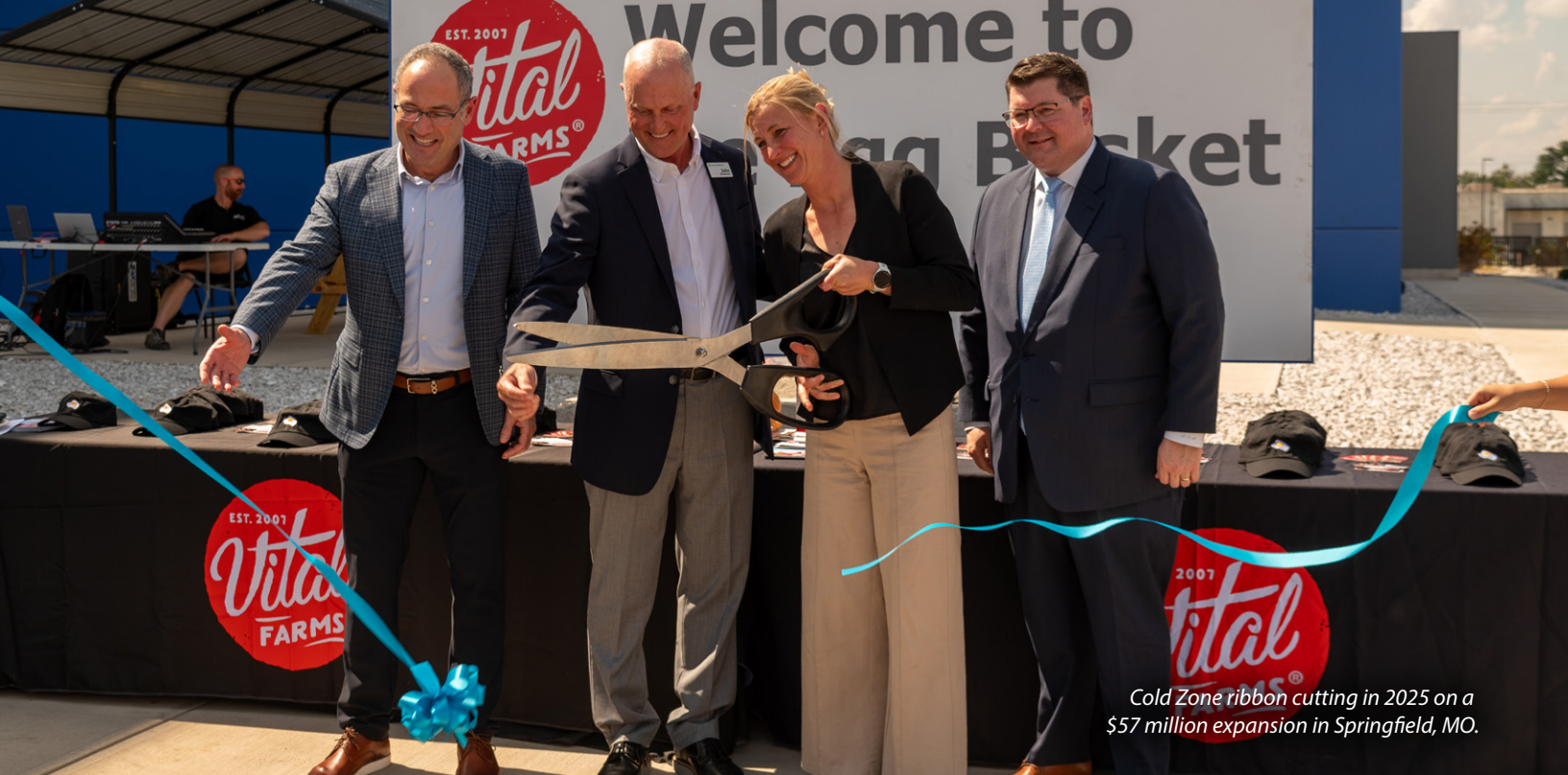
Cold Zone ribbon cutting in 2025 on a $57 million expansion in Springfield, MO.