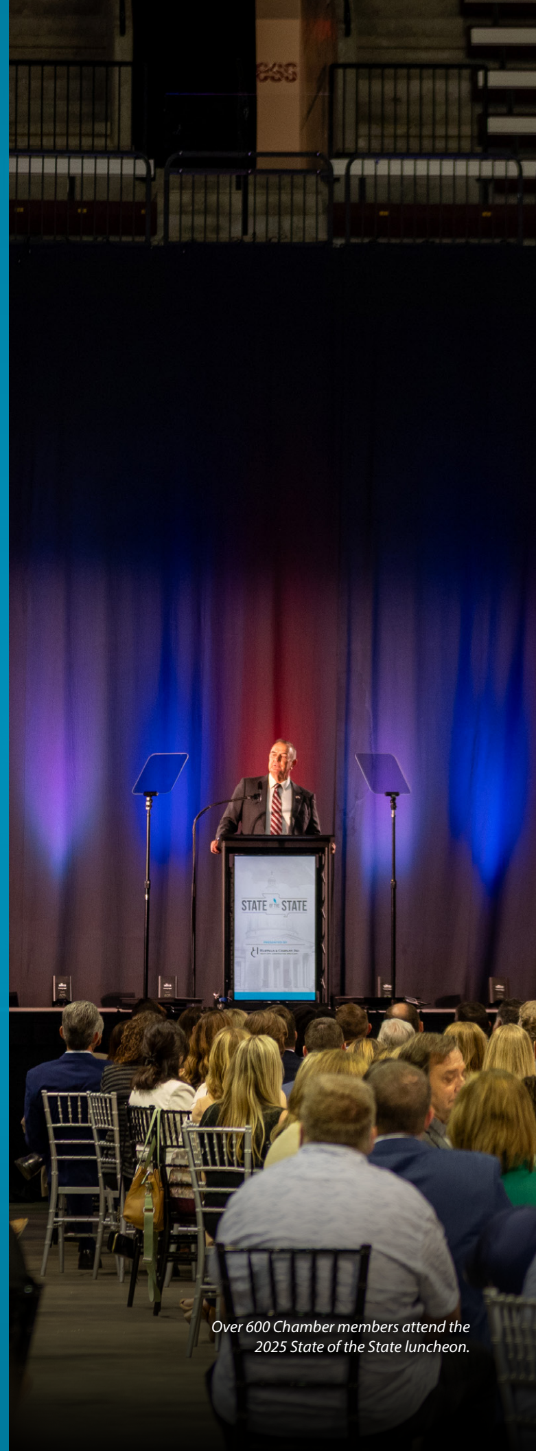
Over 600 Chamber members attend the 2025 State of the State luncheon.