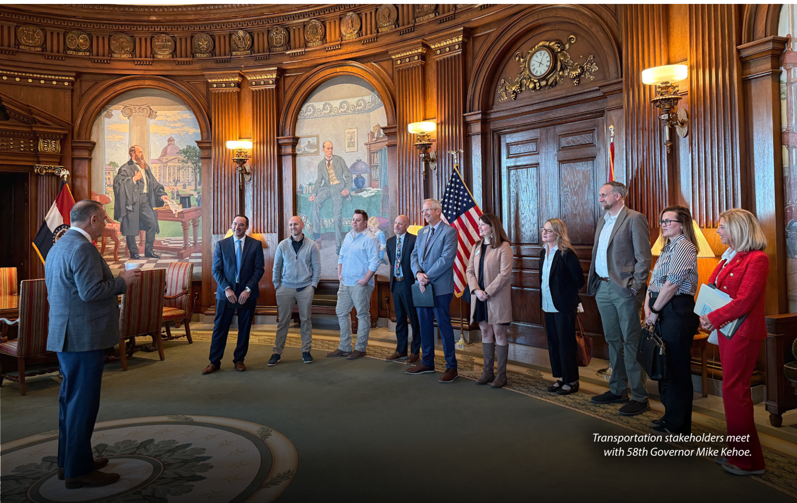
Transportation stakeholders meet with 58th Governor Mike Kehoe.