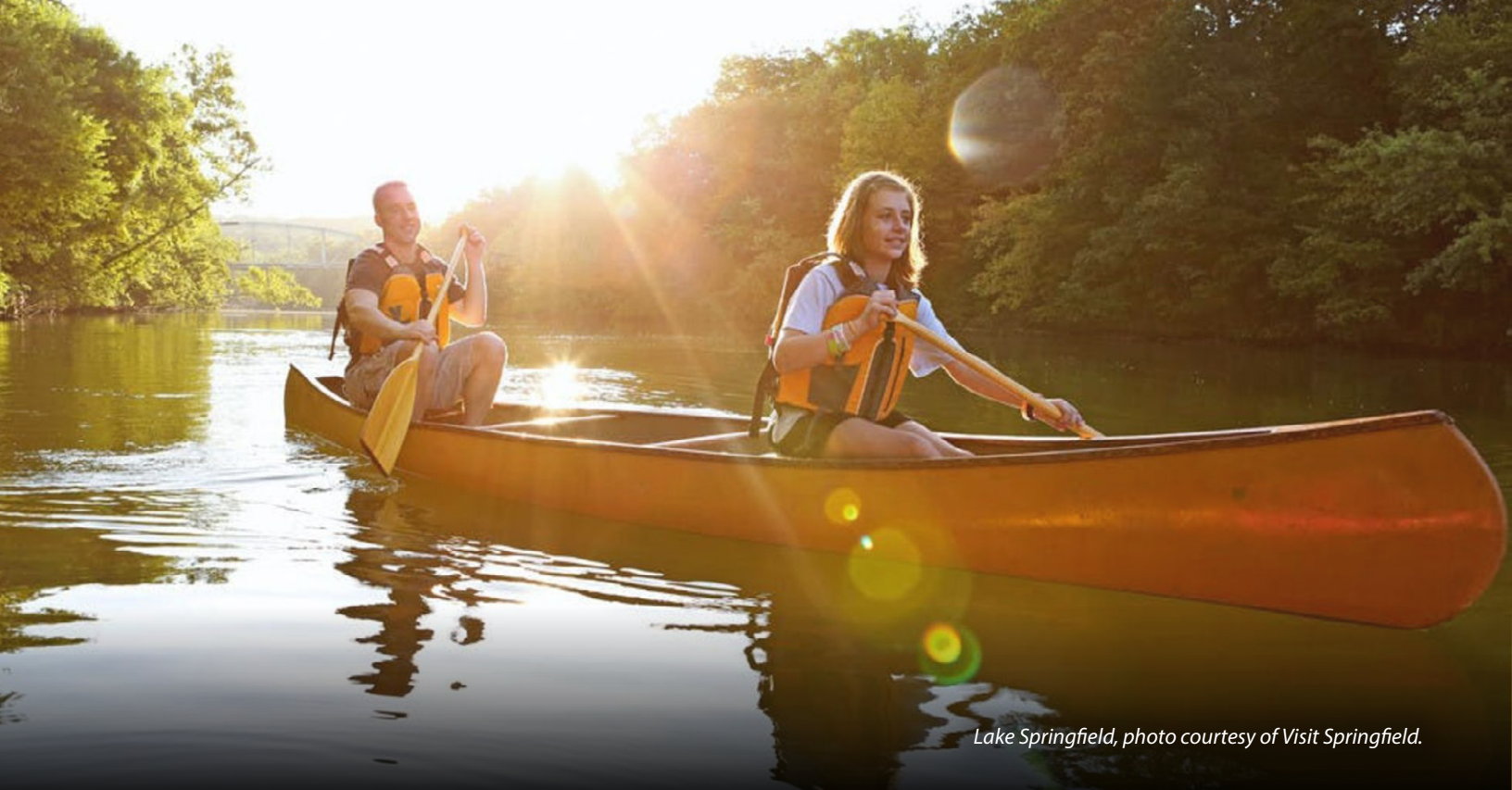
Lake Springfield, photo courtesy of Visit Springfield.